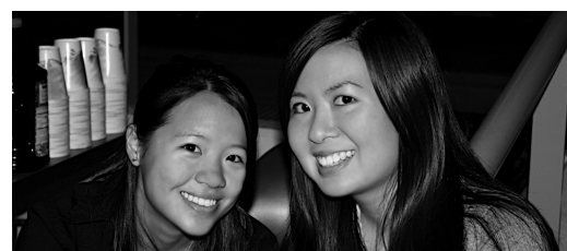
Presidents at Sophomore Recognition.

As always, our goal at GK is to help you realize your potential, engage in the community and meet others from a multitude of disciplines. Thus, the officer team has been working hard to plan a myriad of social activities, honorary member lectures, community service activities, and academic and professional development events that