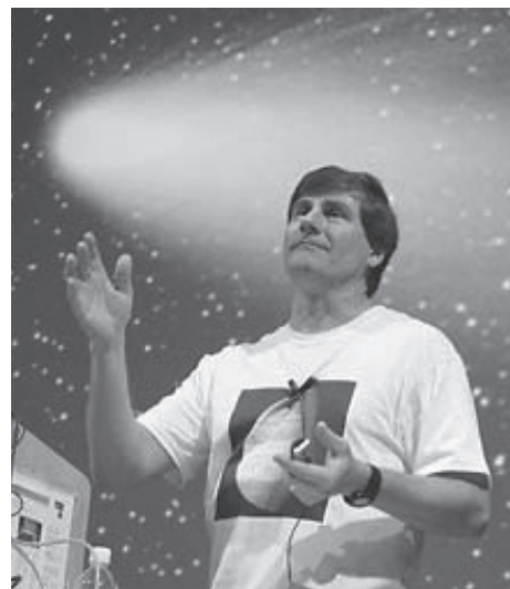
Professor Alex Filippenko

You may recognize Professor Filippenko's name as he has won many top teaching awards at Berkeley, has been voted the “Best Professor” on campus five times, and was selected in 2006 as the Carnegie/CASE Professor of the Year among doctoral institutions. In addition to teaching, he has published numerous research papers, produced three astronomy video courses with The Teaching Company, coauthored an award-winning textbook, and is one of the world's most highly cited astronomers. If you have ever gazed up at the stars with wonder and are interested in learning more