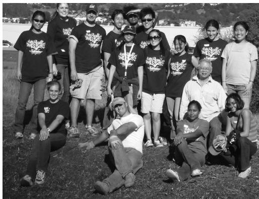
GK members unite with other clubs for Berkeley Project '08 at Point Isabel.