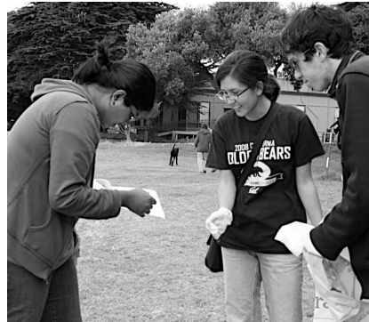
GK members helping with the Coastal Cleanup at the Berkeley Marina on September 26th.

The next community service project will be Berkeley Project where student organizations from all over campus will volunteer at various sites throughout the city of Berkeley. GK will be