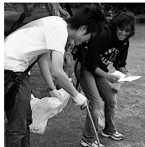
GK officers picking up trash at Berkeley Marina.

a Difference Day, to GK's freshman mentorship program, Golden Key members have demonstrated their great enthusiasm to help their community.