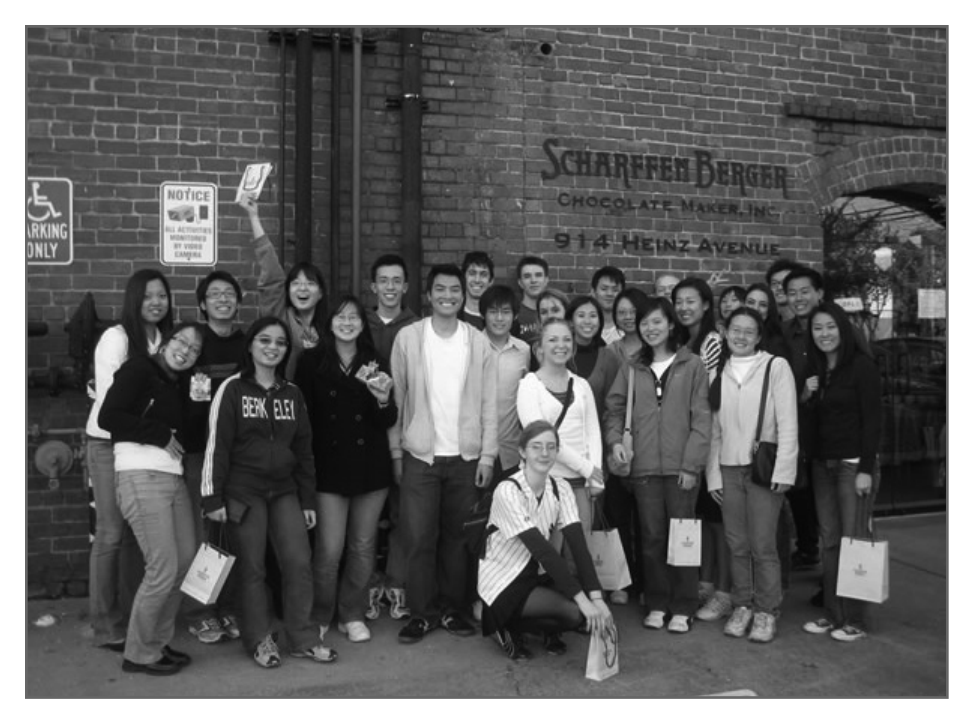
GK members pose outside of the Scharffen Berger Chocolate Factory with their new goodies in hand!

So, please come join us to meet new members and earn GK points!