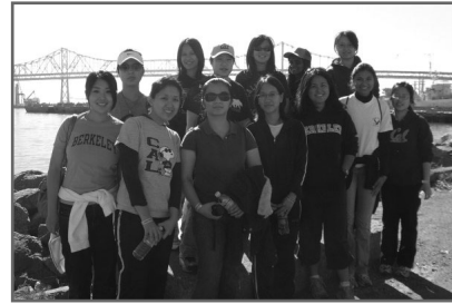
GK members at Memory Walk 2007 on Treasure Island

Golden Key also volunteered at the San Francisco International