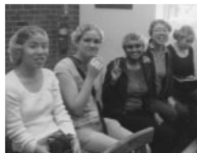
GK at the Scharffenberger tour

eral club social events this semester. These general social events will be FREE to all GK members, so I strongly urge you all to participate and to make any suggestions about the types of activities you would like to have. Further, there will be plenty o p -