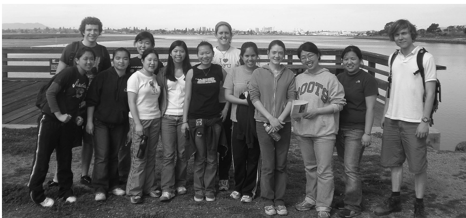
Golden Key members at MLK Shoreline Park during the Save the Bay event

ferent native species at specifically designated patches of land along the wetland habitat marked by blue, red and orange flags. Progress was evident, as the appearance of the site transformed from dry and weed-laden to green and lush with itsy eager-to-grow leaves projecting out of the ground. By the day's end, volunteers had planted over 500 plants, a number well beyond what was initially predicted for the day! This tremendous accomplishment by volunteers accordingly earned a green thumb's up from Save the Bay coordinators.