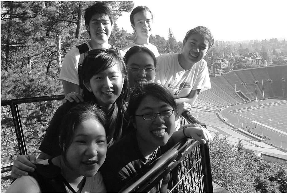
GKers overlook Memorial Stadium during last fall's Hike to the Big C