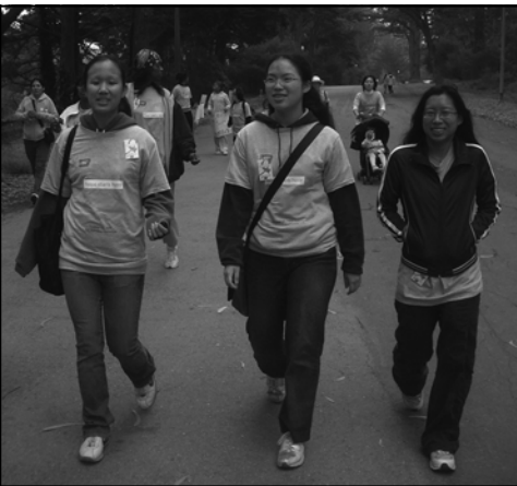
Last semester members walked to fight cancer on Make a Difference Day.

mony that evokes memories of those who have passed away due to cancer. Last year, there was a slide show of cancer victims and a tree of life event in which everyone who has lost someone to cancer signed their names on a