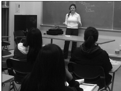
Med-school interview workshop

There are many opportunities to be an active member in Golden Key, and it certainly makes the membership worth it. Also, visit www.goldenkey.org to learn about opportunities offered at the international level. Be involved, make friends,