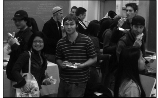
Members enjoy pizza with points at the first general meeting

the newsletter, so you can contribute by spreading awareness of Golden Key or writing an interesting article of your