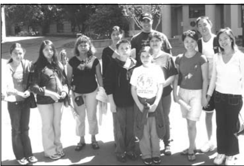
Golden Key members visit with students from the South Berkeley YMCA

On October 22, 2005, "Make A Difference Day," our chapter will walk to