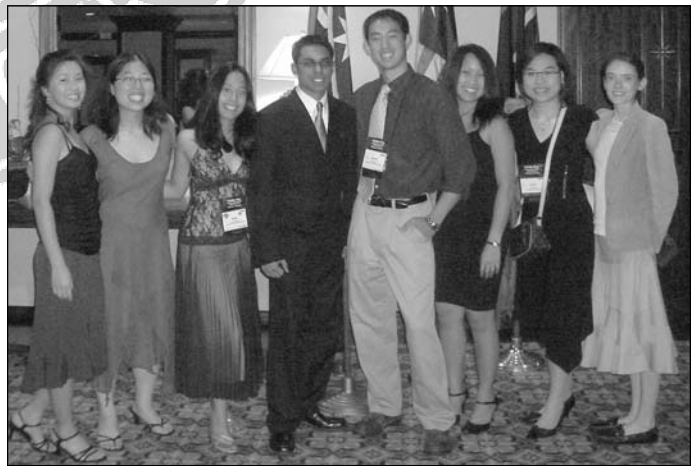
UC Berkeley and Monash Golden Key members

This August Golden Key delegates converged upon Los Angeles for the 2005 International Conference. Ten members of UC Berkeley's chapter were among the 700 Golden Key members to attend the successful event.