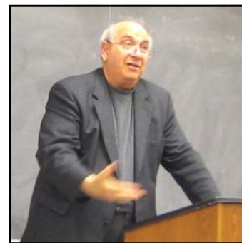
The late, Alan Dundes , speaking at a GK mini-lecture in February.