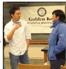
Mingling at 1st General Meeting of the Spring semester.

Once the necessary information has been verified, we will hand you your coveted invitation. We hope this helps to clarify any confusion out there as to why some got invited and others did not. Best of luck! ■